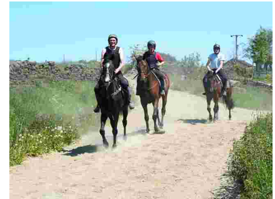
Horses training on Birch Close Lane