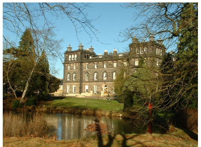
Ilkley Hydro (now residential)

Once over the stile the faint path/sheep track bears very slightly to your left heading in a southerly direction as you start climbing up towards the sky line by walking parallel to the shooting butts which can be seen across the moor to your left. On reaching the top of the incline, the moorland levels out as you make your way straight ahead following the well worn path to the boundary wall of the tree plantation, which can be seen in the distance