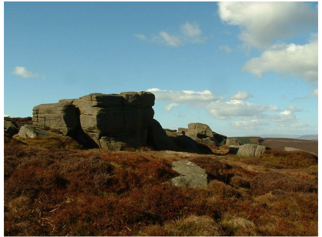
East Buck Stones

On reaching the back of the building turn right then immediately left down the steps to walk along the side of the building before starting your final descent down the steep footpath back to Wells Road car park which can be seen below.