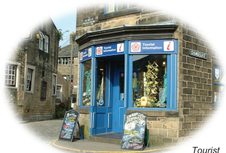
Tourist Information Centre

Situated at the top of Main Street, Haworth the centre was used in the film as the butchers shop.