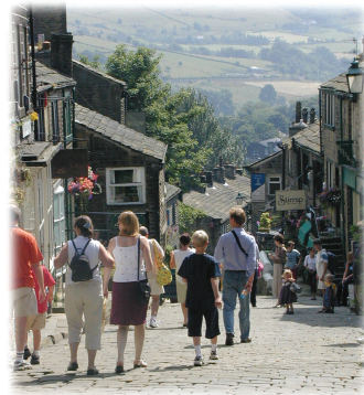
Haworth Main Street

Seen when the children were collecting birthday gifts for Perks.