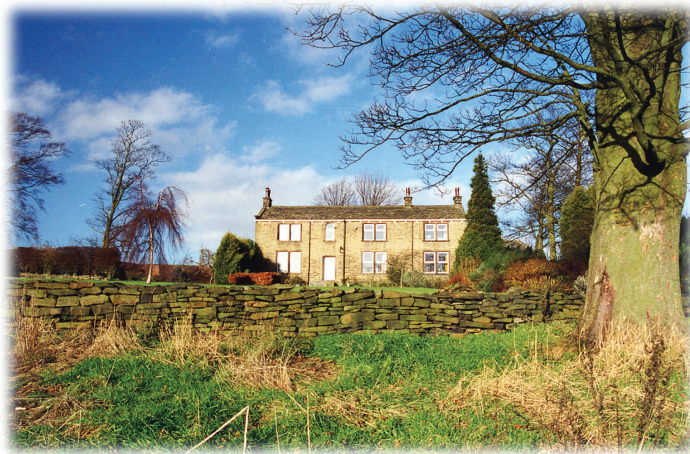
The Three Chimneys