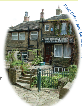
Post Office and General Store