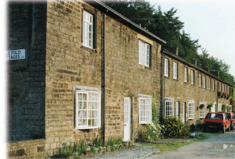
Vale Fold Cottages

Row of cottages seen during the paper chase. The mill dam seen in front of these cottages has been drained and planted with trees.