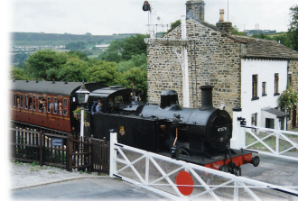
Oakworth Level Crossing

Located across the level crossing from Oakworth station. The first house on the left named 'Railway Cottage' was the home of Mr Perk's. The house next door is a recent addition and is built on land where the wooden outside privy (lavatory) was situated.