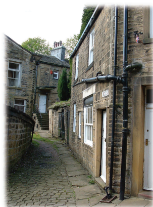
No.2 Lodge Street

9 At the end of the footpath go through the gap out onto the minor road (Ebor Lane), turn left to follow the road crossing the Ebor Mill Dam before bearing right uphill to join the main Haworth Road. Here turn right and walk down past the shops to Haworth Station from where you started your walk.